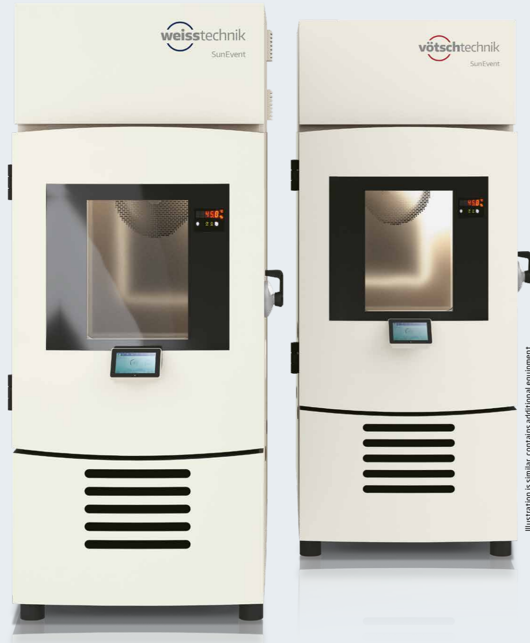
Illustration is similar, contains additional equipment

You can find further details on equipment in our technical descriptions. Contact us.