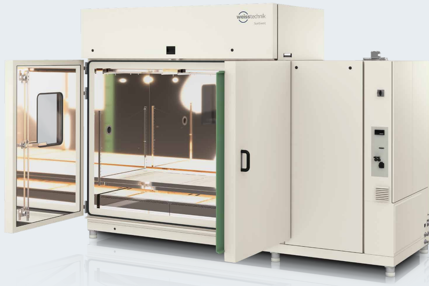
Illustration is similar, contains additional equipment

Higher, wider, bigger. Sometimes, it just has to be bigger: in the automotive supply, electrical and electronics industries and in material testing, both large components and complete assemblies are tested. For these tests, we have developed a Test Chamber with an extra wide test space. So that your XXL test specimens can easily fit and ease of use is ensured.