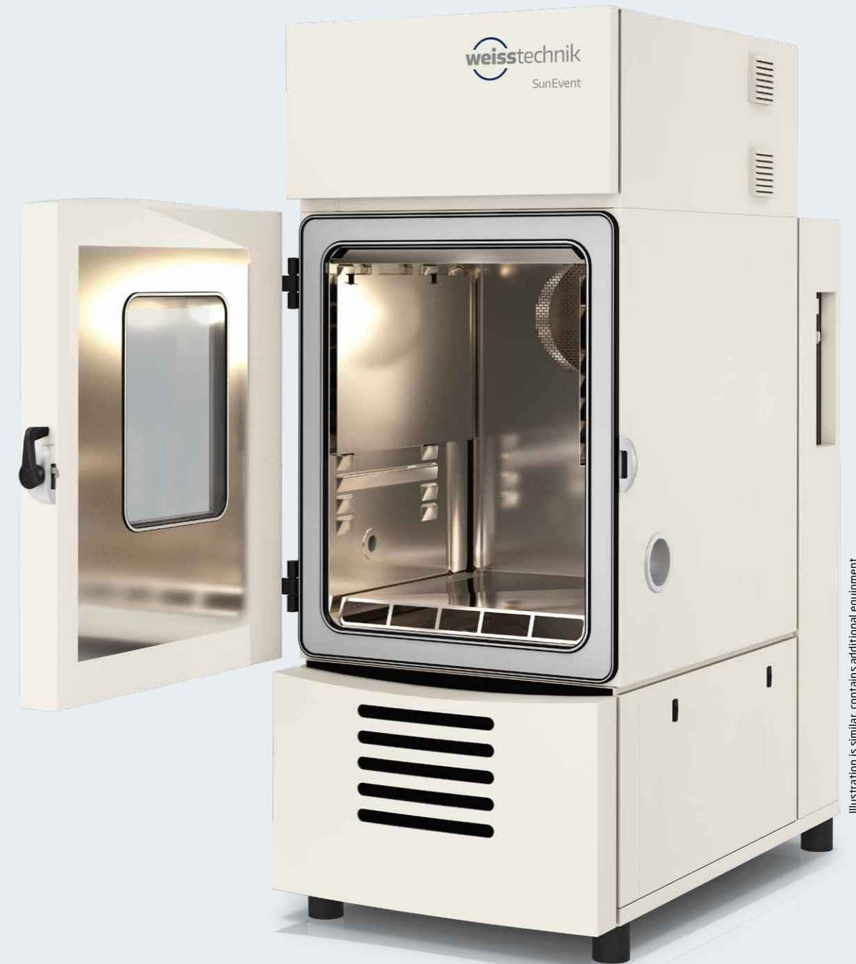
Illustration is similar, contains additional equipment

You can find further details on equipment in our technical descriptions. Contact us.