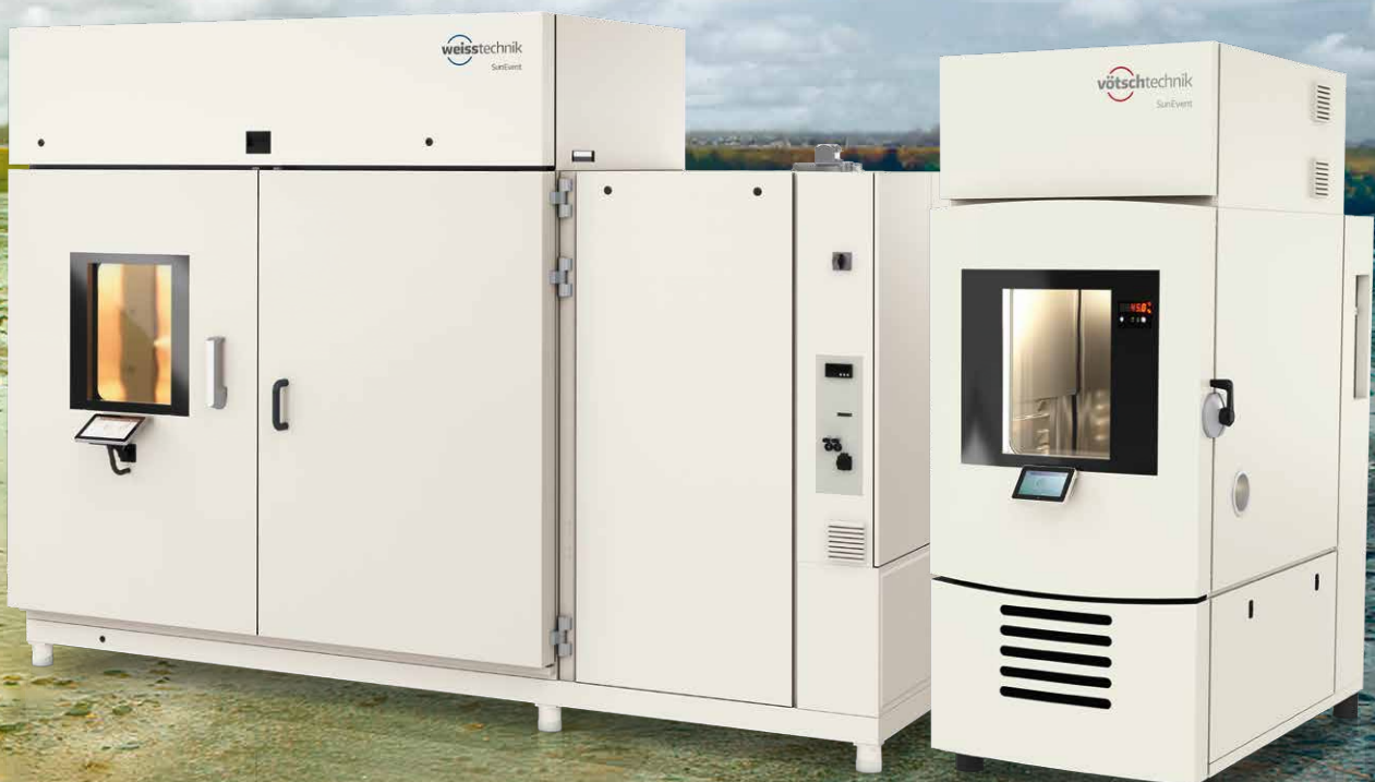
Illustration is similar, contains additional equipment