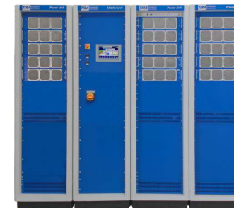
Amplifier (Illustration similar)