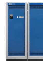
Field power supply